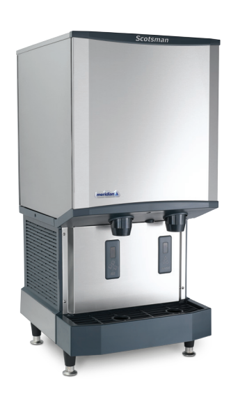
HID540 up to 500 lbs./day* stores 40 lbs.