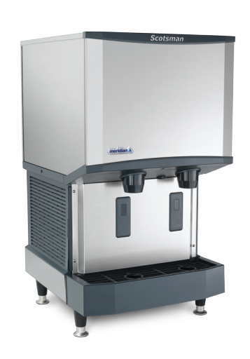
HID525 up to 500 lbs./day* stores 25 lbs.