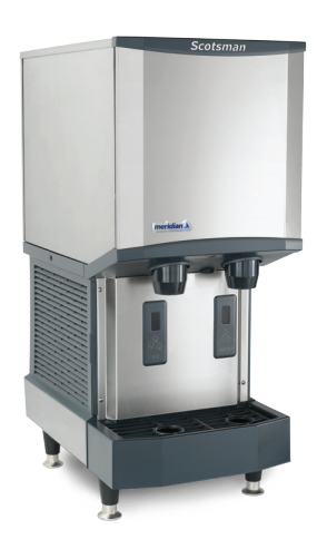
HID312 up to 260 lbs./day* stores 12 lbs.